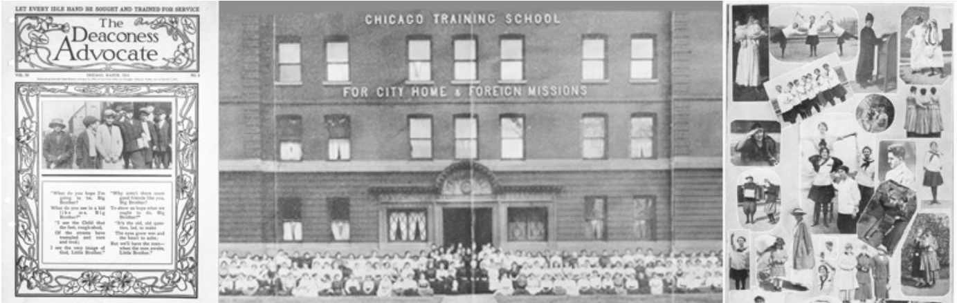
Chicago Training School

Students of the Chicago Training School were expected to spend their summers in ministry with the poor and sick in Chicago. They passed out religious material. They took the neighborhood children to Sunday School, while taking the parents and adults to church. Their studies at school included scripture, church history, Sunday School pedagogy, medicine, and singing. Other subjects added included theology, elocution, social service, women's accomplishments, and the history of the deaconess movement.